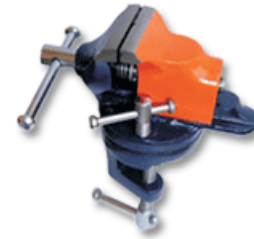
Table Vice Clamp Type Revolving