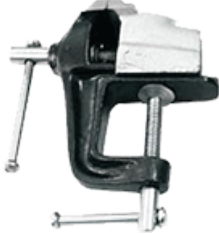
Table Vice with Clamp